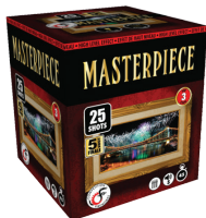
Masterpiece $ 38.25ea