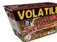
Volatile $ 45.25ea