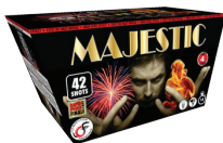
Majestic $ 69.00ea