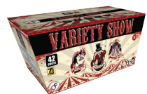
Variety Show $ 62.75ea