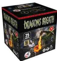
Dragon's Breath $ 38.25ea