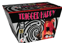
Trigger Happy $ 46.50ea