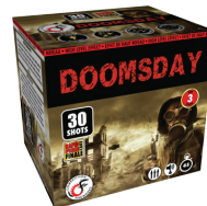
Doomsday $ 51.00ea