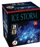
Ice Storm $ 31.50ea