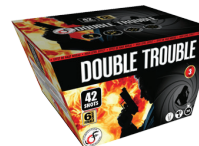
Double Trouble $ 65.00ea