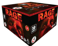
Rage $ 39.50ea