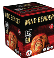
Mind Bender $ 45.25ea