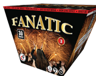
Fanatic $ 42.00ea