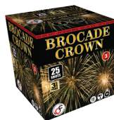
Brocade Crown $ 38.25ea