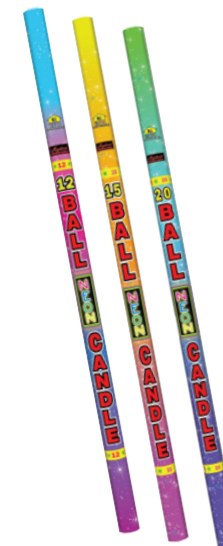
12 Ball Roman Candle $ 2.50ea