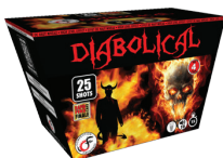
Diabolical $ 39.00ea