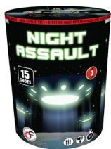
Night Assault $ 22.00ea